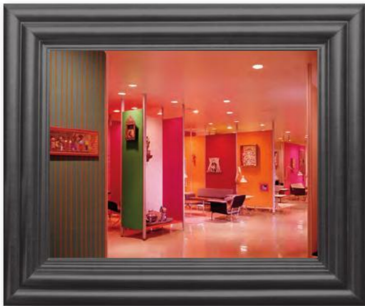
At left: Braniff's design aesthetic included a waiting room (left) that featured chairs designed by Alexander Girard (1907-1993) for the Herman Miller furniture company. | Left center: Three Braniff "hostesses" wearing signature uniforms and bubble helmets by Italian fashion designer Emilio Pucci at the Paris Air Show in the late 1960s. | Below left: A Braniff waiting room at the DFW airport in the 1960s. | Below right: Bold color choices often made Braniff concourses stand out.

research. We've had people who are interior designers and decorators looking at pictures of Braniff terminals."